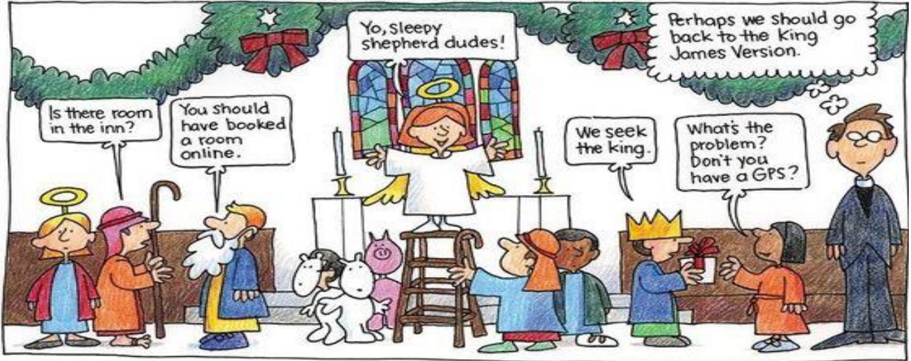
THE RECTOR DROPS IN ON THE PAGEANT REHEARSAL

We are not taking up a collection during the service. You will find the offertory plate at the back of the church at the entry to the worship area. Direct debit forms are also available in the foyer and on our website. Thank you for your contribution to the mission of the church which is gratefully received.