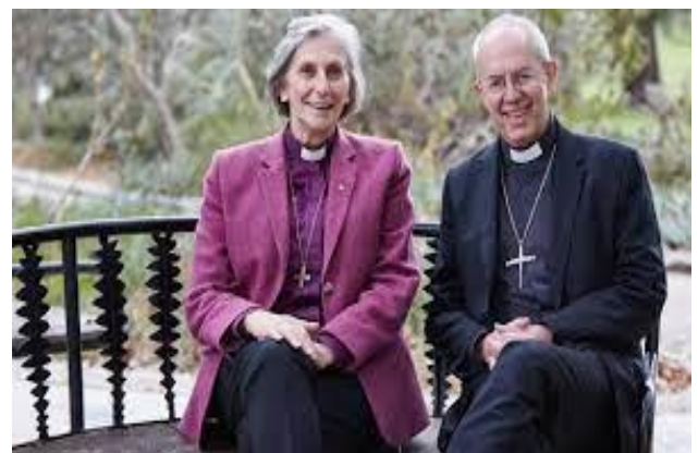
The Archbishop of Canterbury Justin Welby with the Archbishop of Perth Kay Goldsworthy on his recent visit to Perth.

IF .. God answered prayers using a phone system .