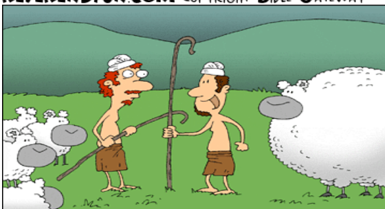
(See John 10:1-18) 08-21-2009 I FIND IT MUCH EASIER TO BE A GOOD SHEPHERD WHEN I AM CARING FOR ONE SUPER LARGE SHEEP INSTEAD OF A WHOLE FLOCK OF SMALL ONES